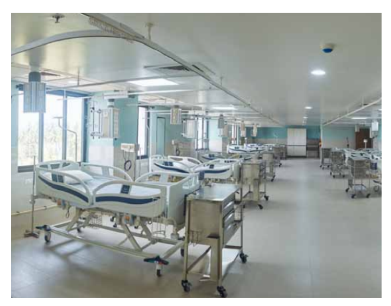
Ranipet Campus ICU

The Low Cost Effective Care Unit (LCECU) began in 1982. It caters to the needs of those living in the urban slums of Vellore. LCECU works holistically to bring not only healing to the body but also takes care of familial and community relationships.