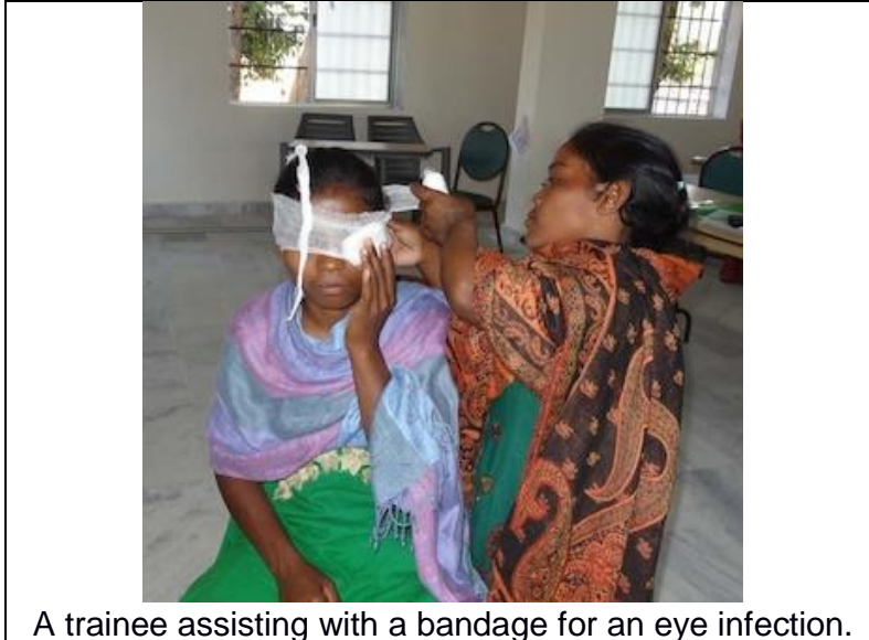
A trainee assisting with a bandage for an eye infection.