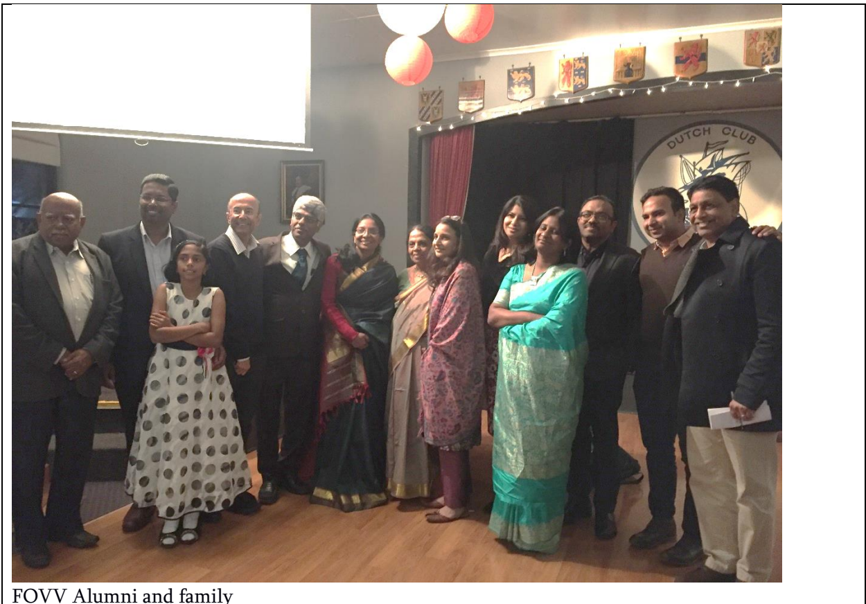
FOVV Alumni and family