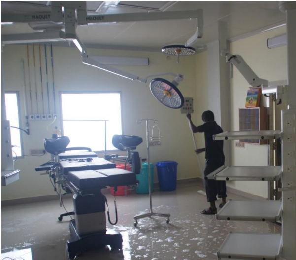
Chittoor Campus Operating Theatre: final preparations before opening

Meanwhile the growing out-patient department offers many general and specialist clinics.