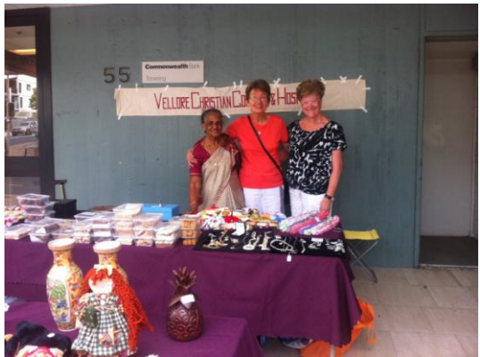
Workers at the Toowong Stall

Nearly one third of the Qld Group's income was from the Stalls and the Dinner. Many people work hard to achieve that.